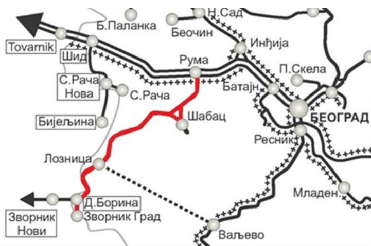
Figure 1. Geographic position of the railway section Ruma - Sabac – Donja Borina Junction - State border on railway network at Republic of Serbia

This Terms of Reference (ToR) document relates to the preparation of the necessary Spatial Planning and Technical Documentation for the reconstruction and modernization of this railway line and its service points and shall result in the establishment of enhanced railway line parameters and increase in reliability, aiming to increase the railway line safety, capacity and quality as well as the competitiveness of rail transport.